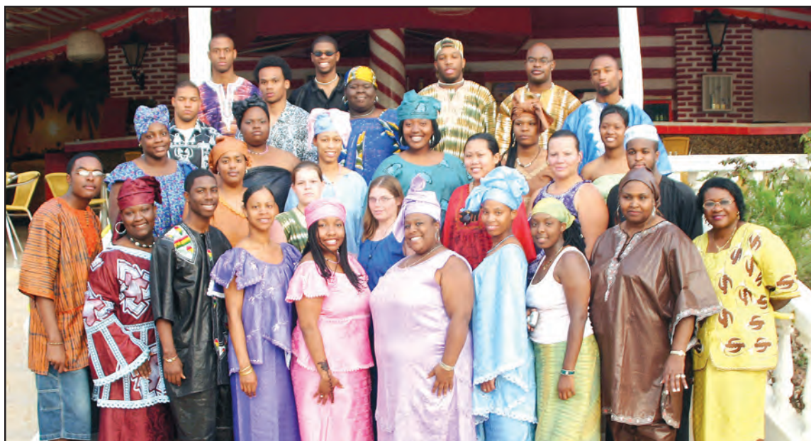
Before attending a welcoming ceremony, Langston University students posed in traditional African attire.