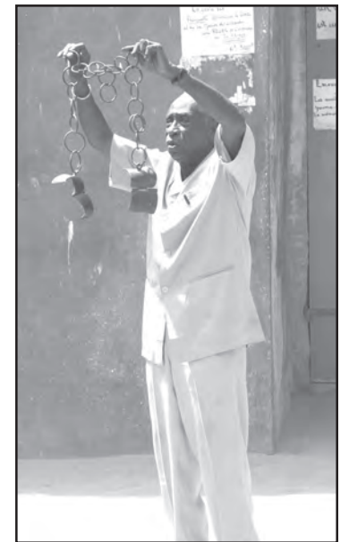
The curator of a museum on Goree Island holds up an example of the type of chains that Africans were forced to wear.

“A lot of their systems are like the European systems. They wear the white wigs and stuff like that,” he said. He also noticed that during the trial, the defendants were not in shackles and chains like people usually are here in the states. “The police officers over there don’t carry guns like we do over here and one of the main reasons why is because of the respect the people have for authority,” he explained.